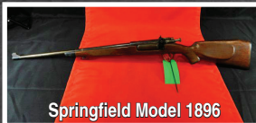
Springfield Model 1896