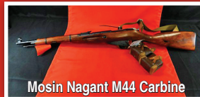
Mosin Nagant M44 Carbine

For information contact TERRY HOENIG of Steffes Group at 319.470.7120