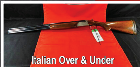
Italian Over & Under